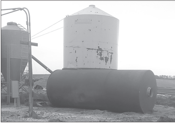
This old fuel barrel, which was used for grain storage was blown over by the strong winds five miles north of Napoleon at the Logan Wald farm last Thursday, June 19.